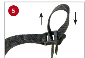
Ribs on buckle should face up. Thread strap through buckle as shown.