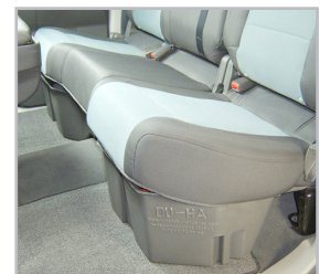
This is how the DU-HA should look installed under the back seat.